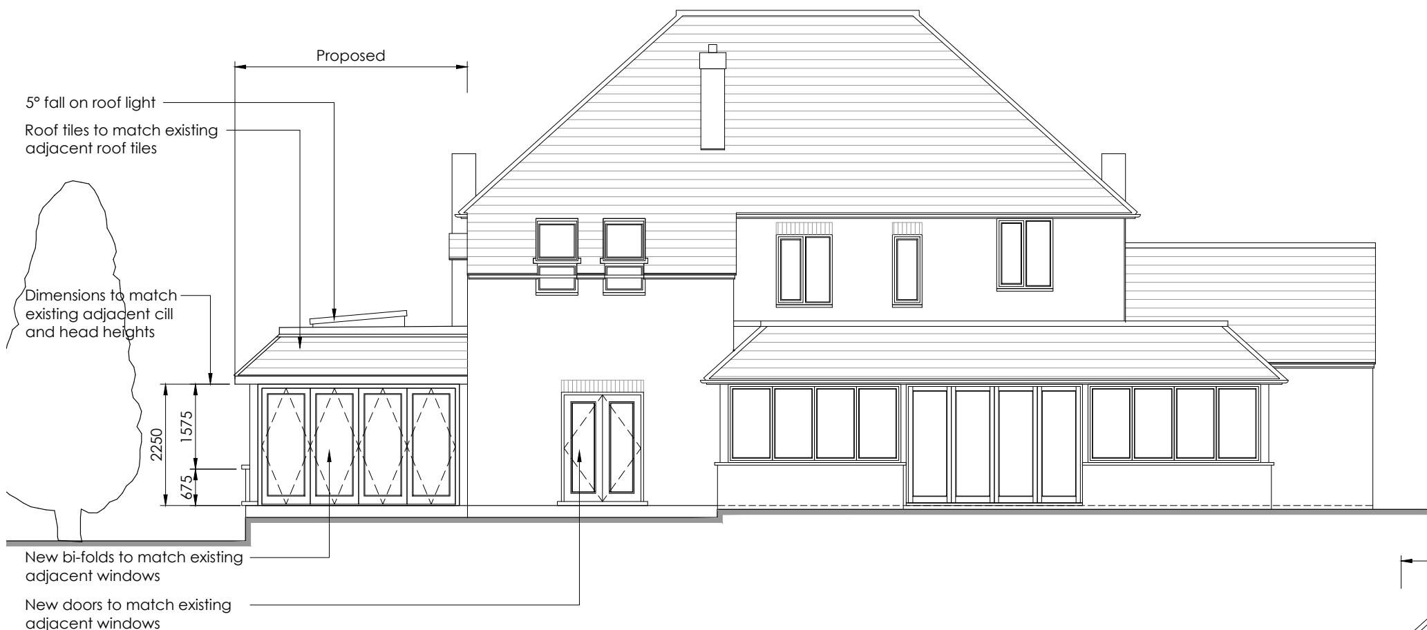
Proposed Rear Elevation scale 1:100

Do not scale from this drawing - all dimensions are to be checked on site prior to work commencing or preparation of working drawings - any discrepancies should be notified immediately - this drawing is the copyright of NuCADD Architectural and should not be reproduced without prior written approval - this drawing is to be read in conjunction with all relevant specifications. When printing off pdf drawings, it is the responsibility of the user to verify that the resulting prints are to scale on the appropriate sized sheet. Also the scale bar on the plan measure correctly. All dimensions in millimetres unless stated otherwise