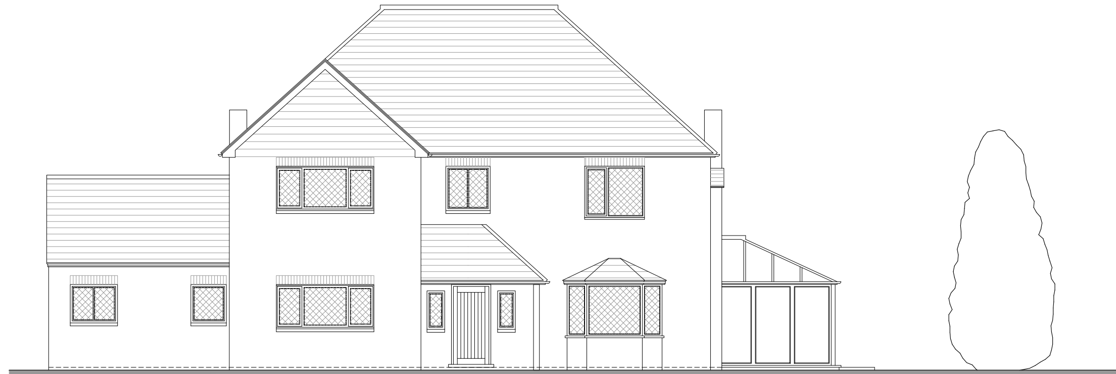
Existing Front Elevation scale 1:100