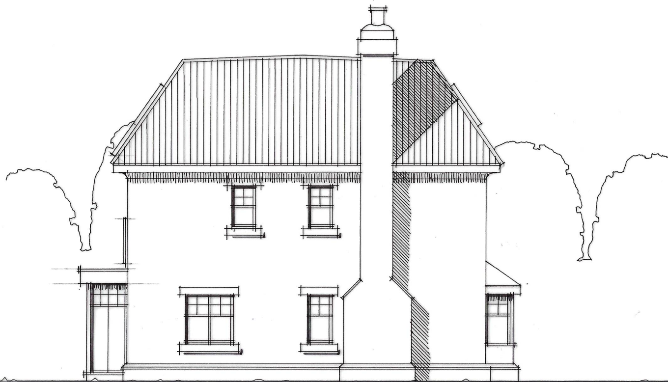
SIDE (NORTH WEST) ELEVATION.