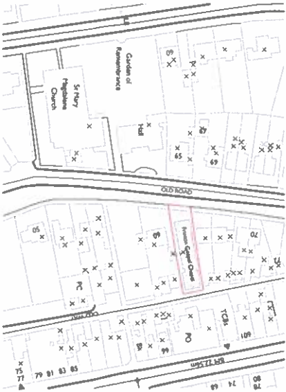
Location Plan 1:320 Scale