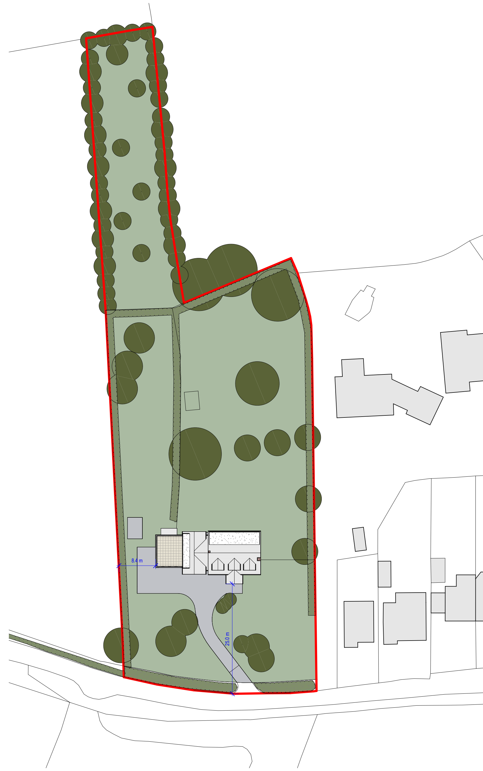
2 Proposed Block Plan 1 : 500