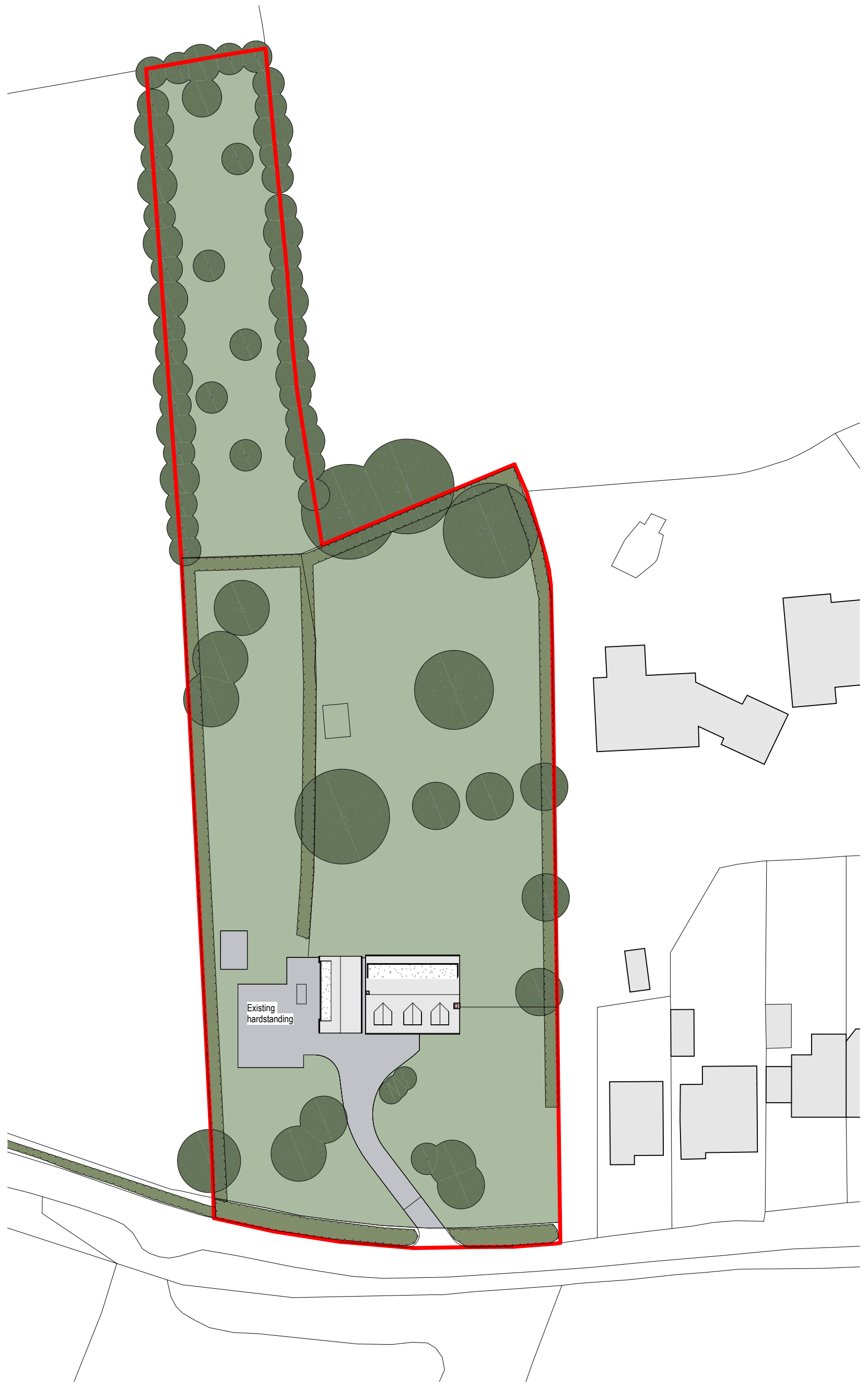
1 Existing Block Plan 1 : 500

DO NOT SCALE FROM THIS DRAWING. WORK TO FIGURED DIMENSIONS ONLY. THIS DRAWING IS THE COPYRIGHT OF THE ARCHITECTS AND SHOULD NOT BE REPRODUCED WITHOUT THEIR EXPRESS PERMISSION