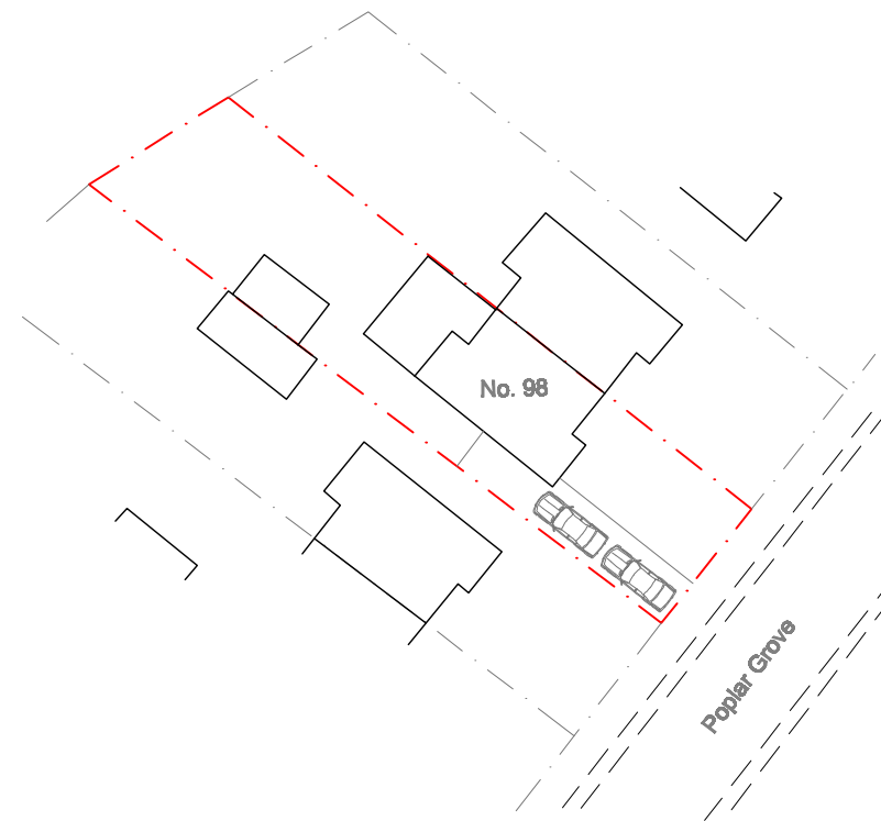
6a Existing Site Block Plan Scale: 1:500