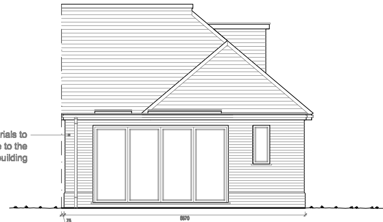
3b Proposed Rear Elevation Scale: 1:100

All proposed external materials to match as closely as possible to the existing building