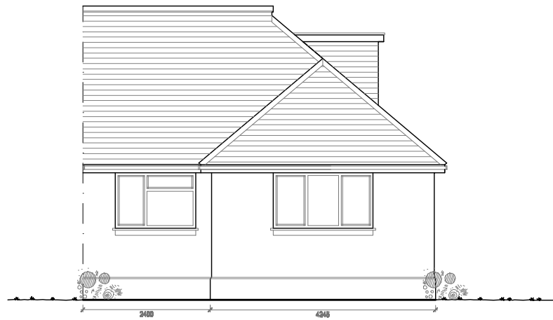
3a Existing Rear Elevation Scale: 1:100

All proposed external materials to match as closely as possible to the existing building