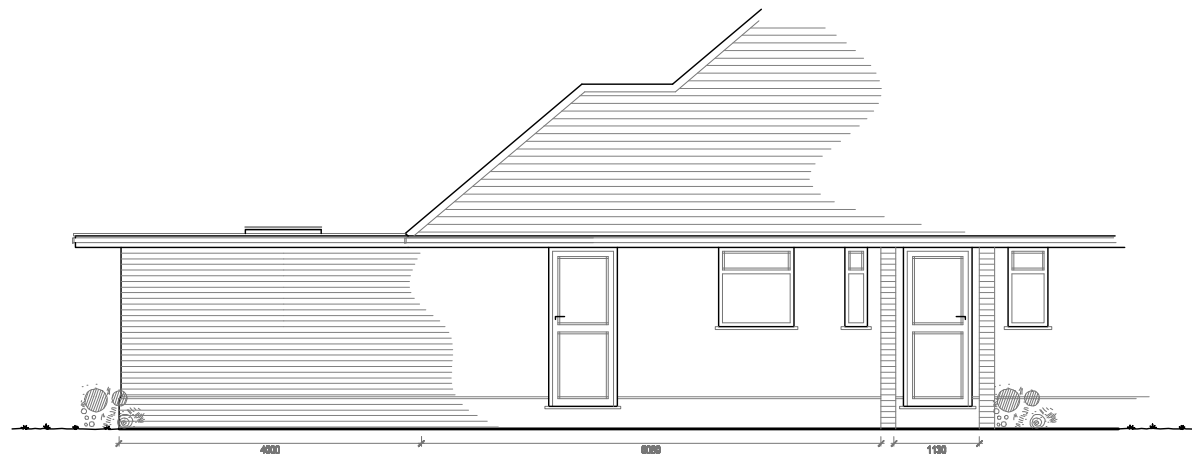
4b Proposed Side Elevation Scale: 1:100