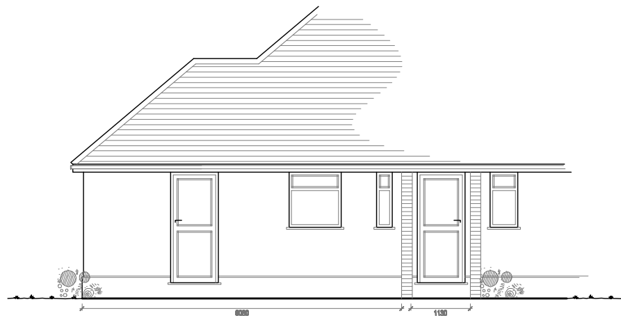
4a Existing Side Elevation Scale: 1:100