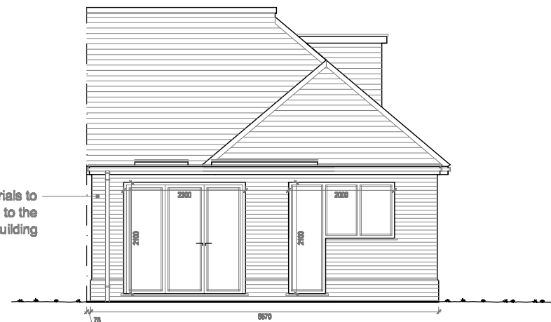
3b Proposed Rear Elevation Scale: 1:100

All proposed external materials to match as closely as possible to the existing building