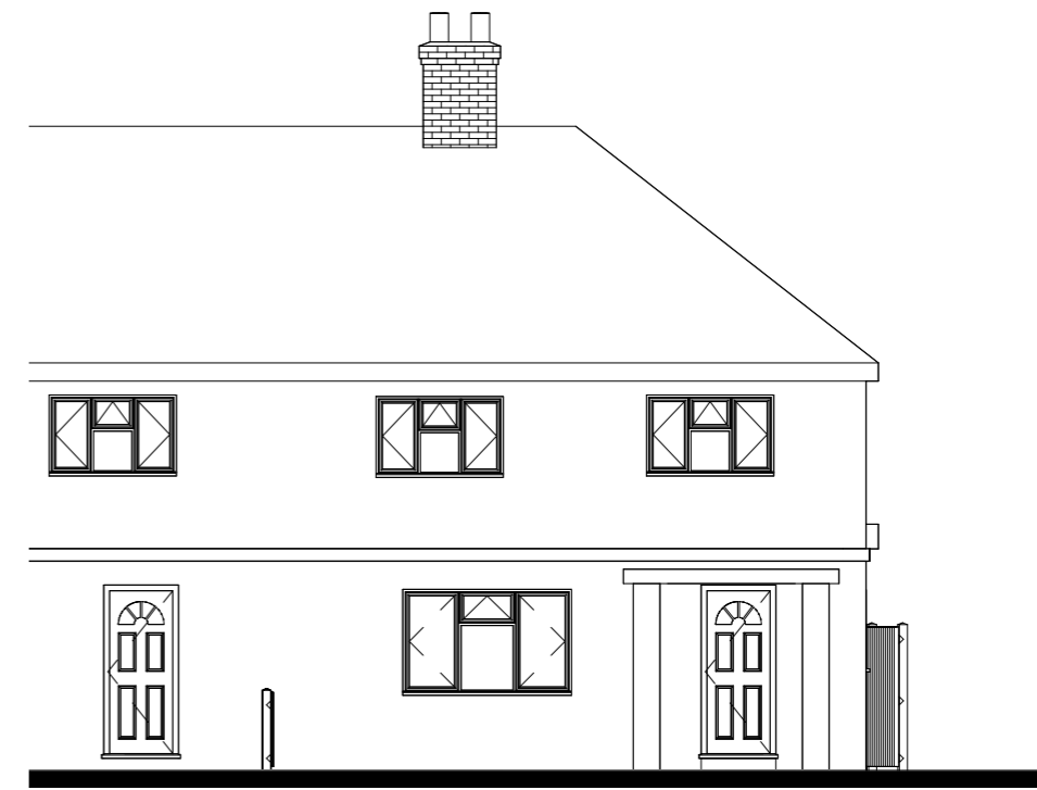
2 Front Elevation 1 : 100