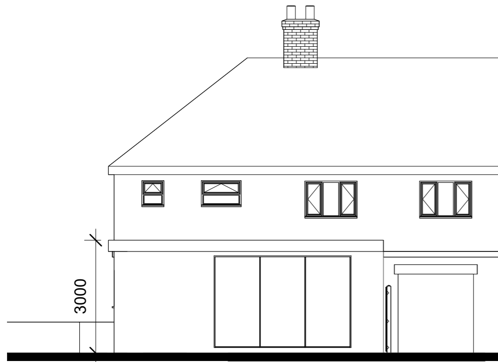
1 Rear Elevation 1 : 100