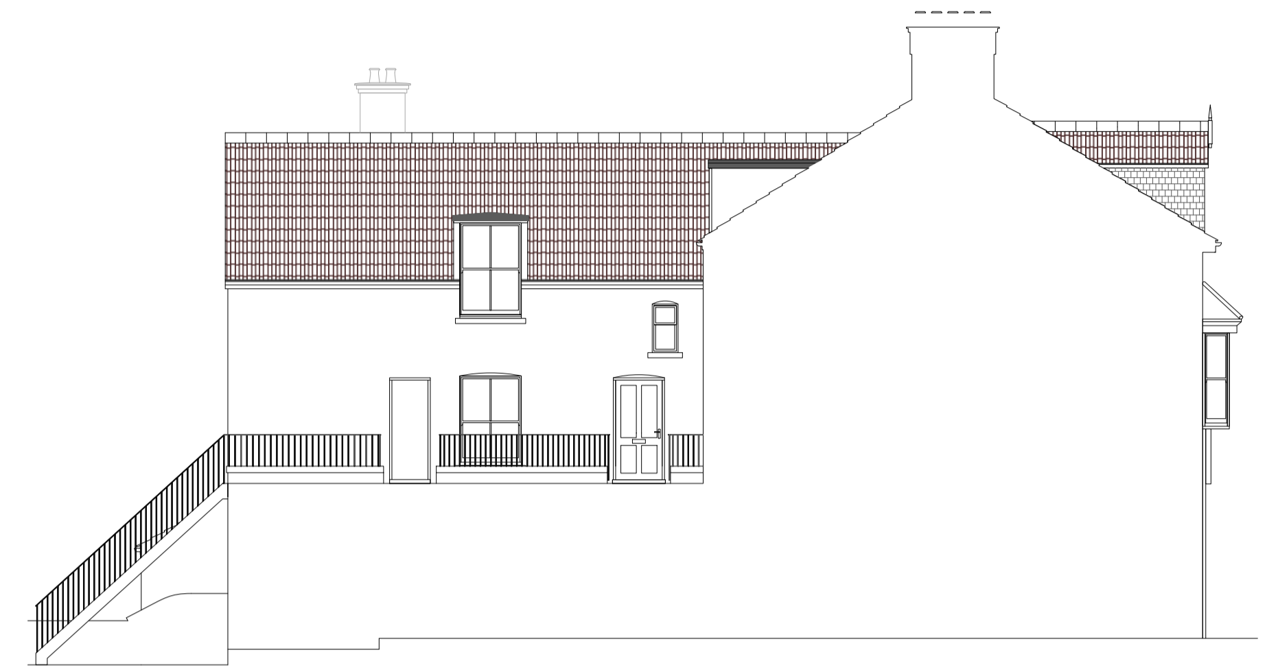
Existing Left Hand Side Elevation