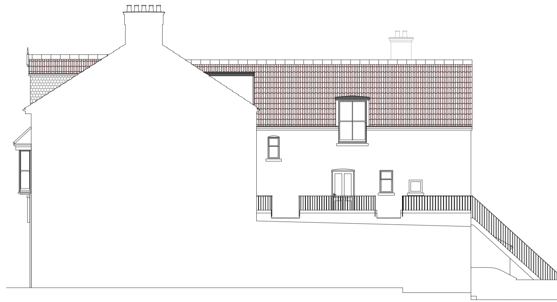
Existing Right Hand Side Elevation