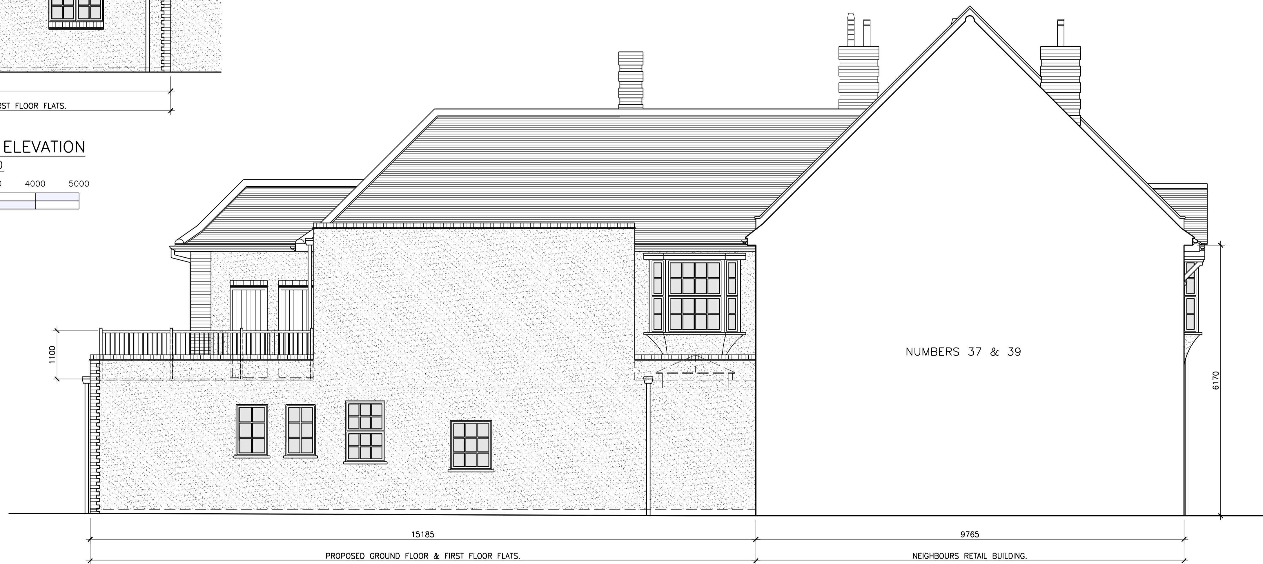
ASSUMED PROPOSED SIDE ELEVATION

Balustrading :- New galvanised steel balustrading to existing balcony terrace with SHS posts & an RHS horizontal handrail to perimeter, & with vertical galvanised steel spindles at max. 100mm centres.