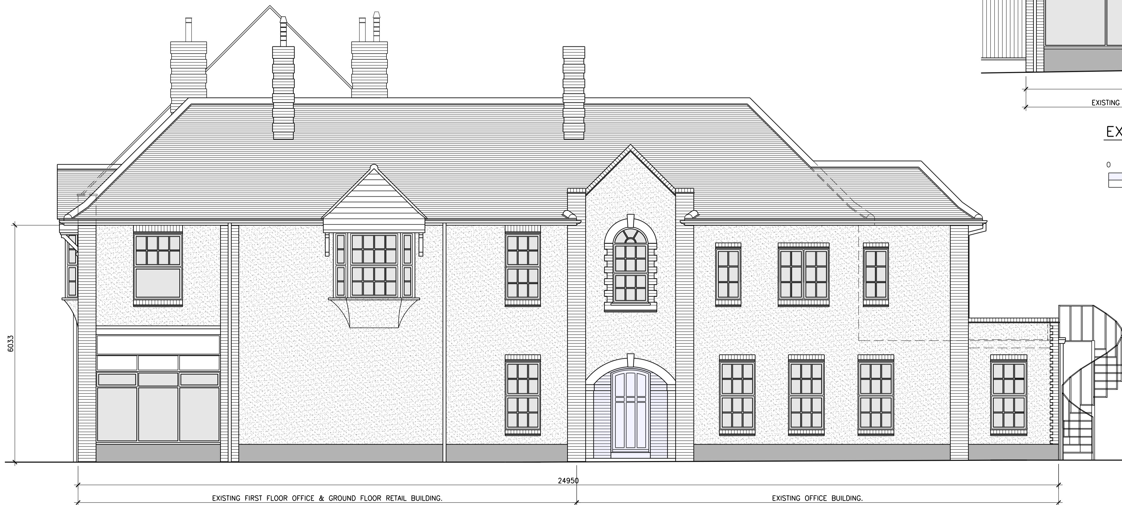
EXISTING SIDE ELEVATION SCALE 1:50