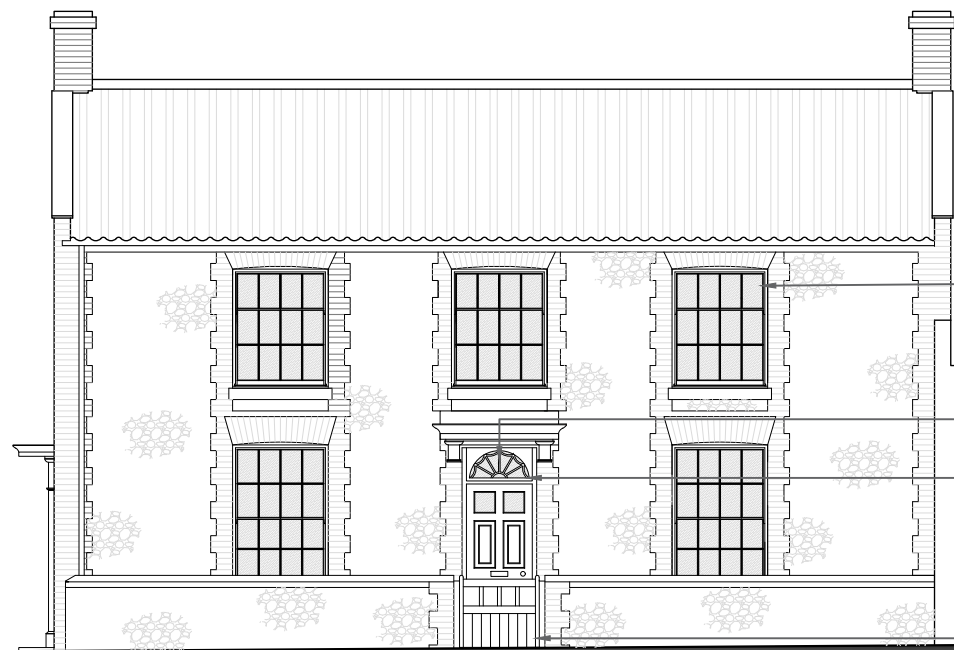
Proposed Street Elevation showing front gate 1:100 @ A3