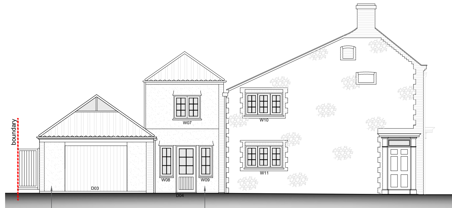
Proposed Side Elevation 1:100 @ A3

Areas with unattractive modern LBC brickwork on the rear elevation, proposed to be rendered to maintain consistency and match the two storey link between the original house and the garage.