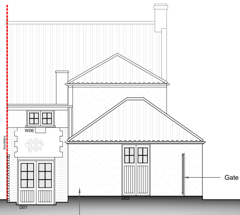
Proposed Rear Elevation 1:100 @ A3

Areas with unattractive modern LBC brickwork on the rear elevation, proposed to be rendered to maintain consistency and match the two storey link between the original house and the garage.