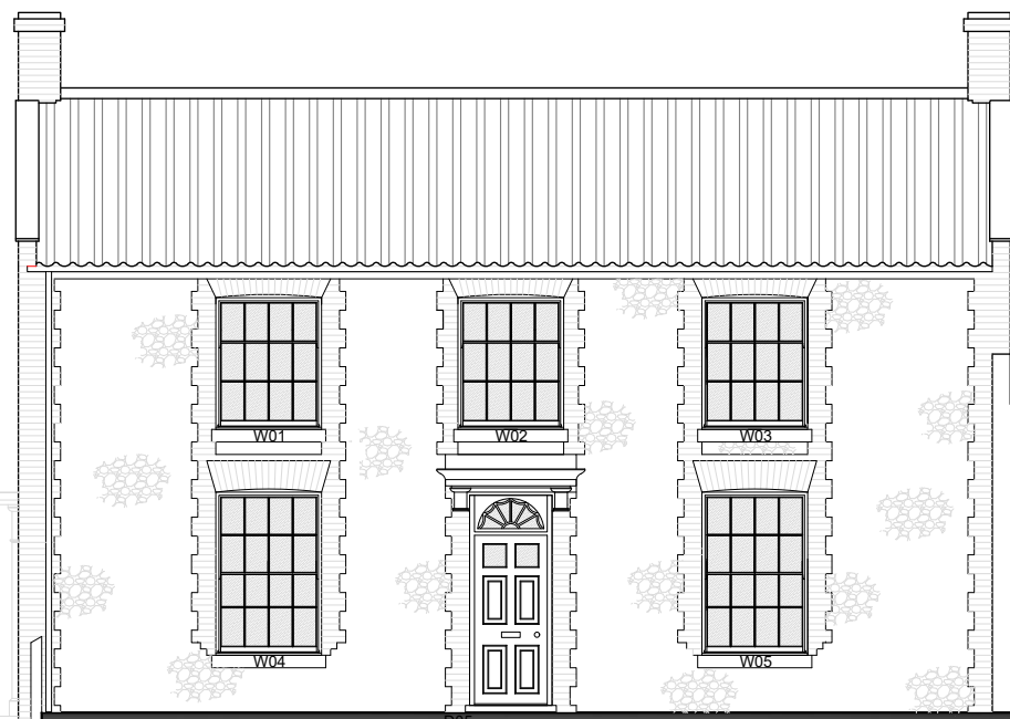
Proposed Front Elevation 1:100 @ A3