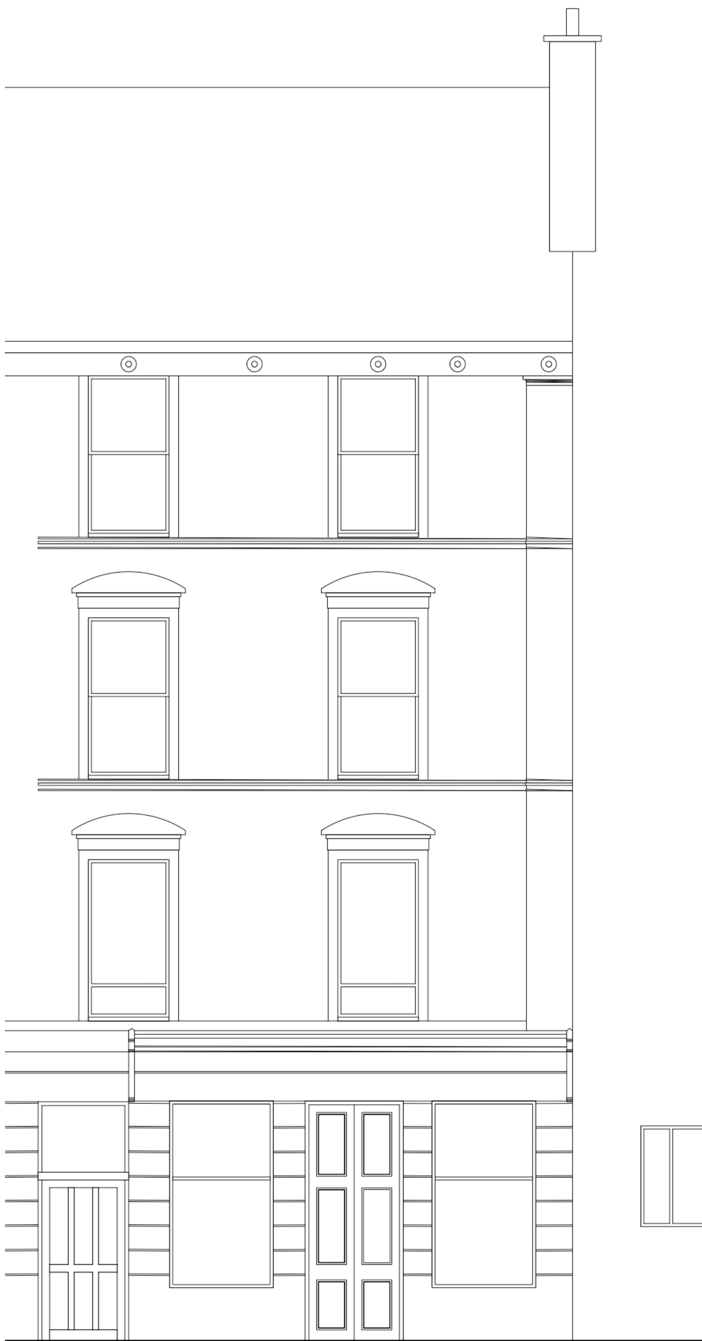
Existing Front Elevation 1:50