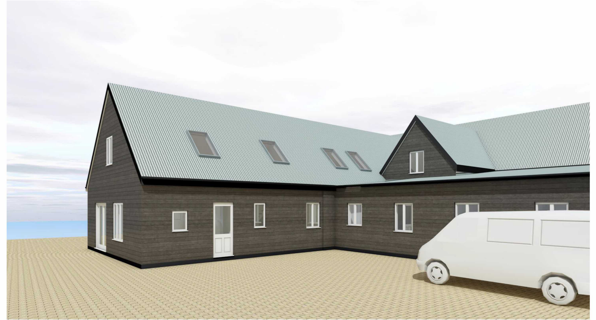
PROPOSED NORTH WEST VIEW