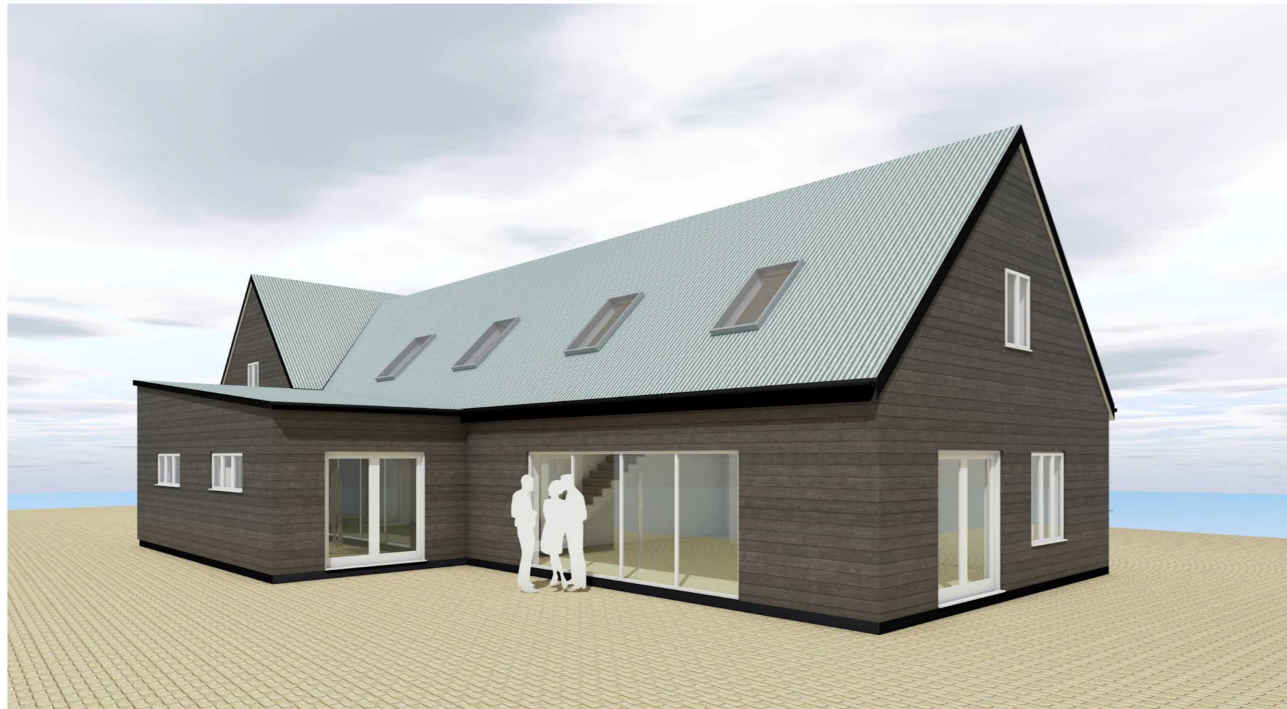
PROPOSED NORTH EAST VIEW

This document and its design content is copyright ©. It shall be read in conjunction with all other associated project information including models, specifications, schedules and related consultants documents. Do not scale from documents. All dimensions to be checked on site. Immediately report any discrepancies, errors or omissions on this document to the Originator. If in doubt ASK. It is assumed that all works on this drawing will be carried out by a competent contractor working, where appropriate, to an appropriate method statement.