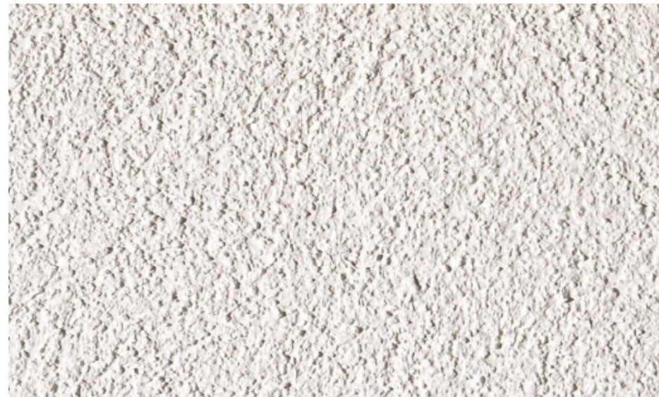
3. White Render

This document provides materials details to enable to the discharge of condition 11 of the outline planning permission of 23/1261/REM namely: