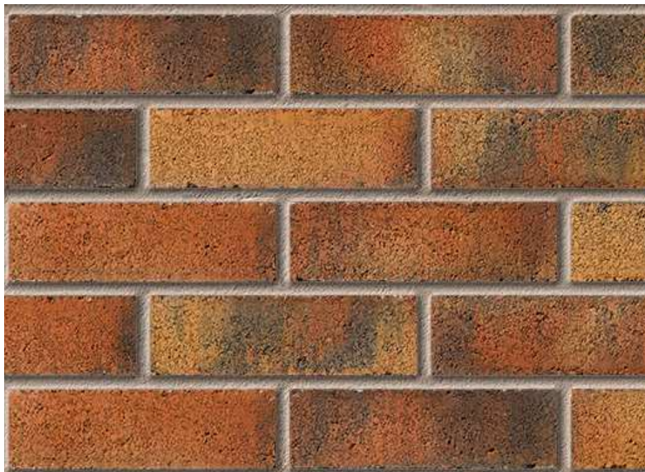
2B) Tobermore Kingston Moorland Brick