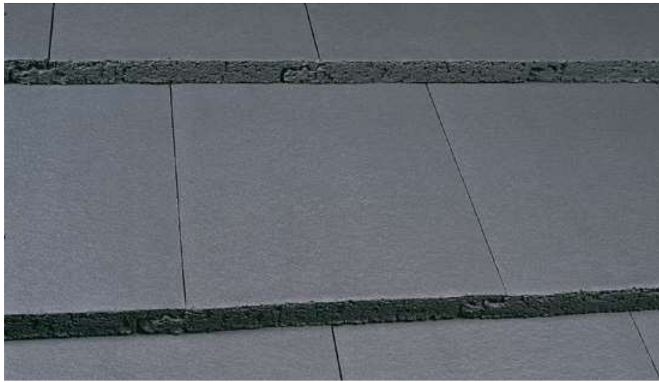
1. Marley Modern Grey tile