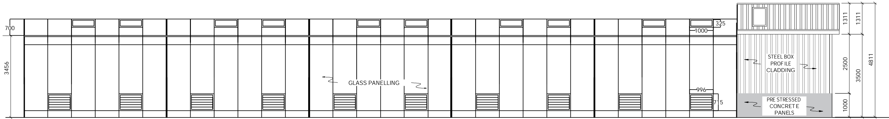
2 NORTH EAST ELEVATION SCALE: 1:200 @ A3