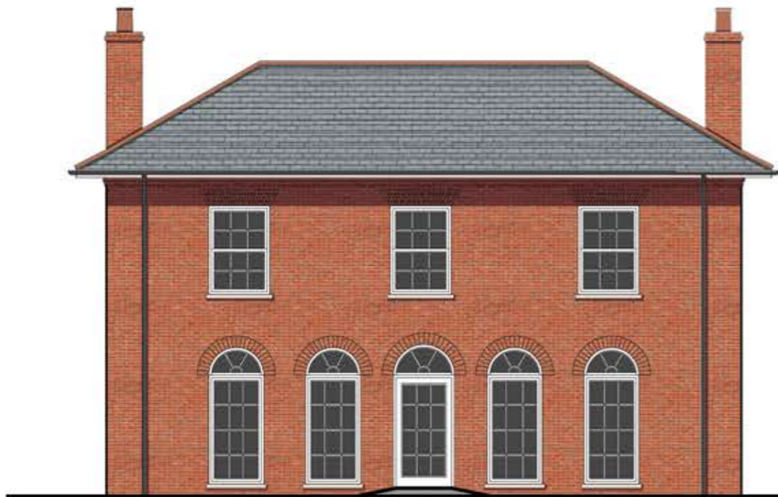
REAR ELEVATION - South