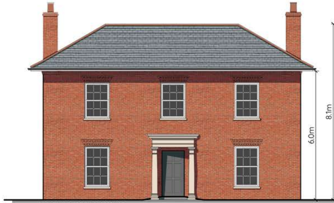
FRONT ELEVATION - North