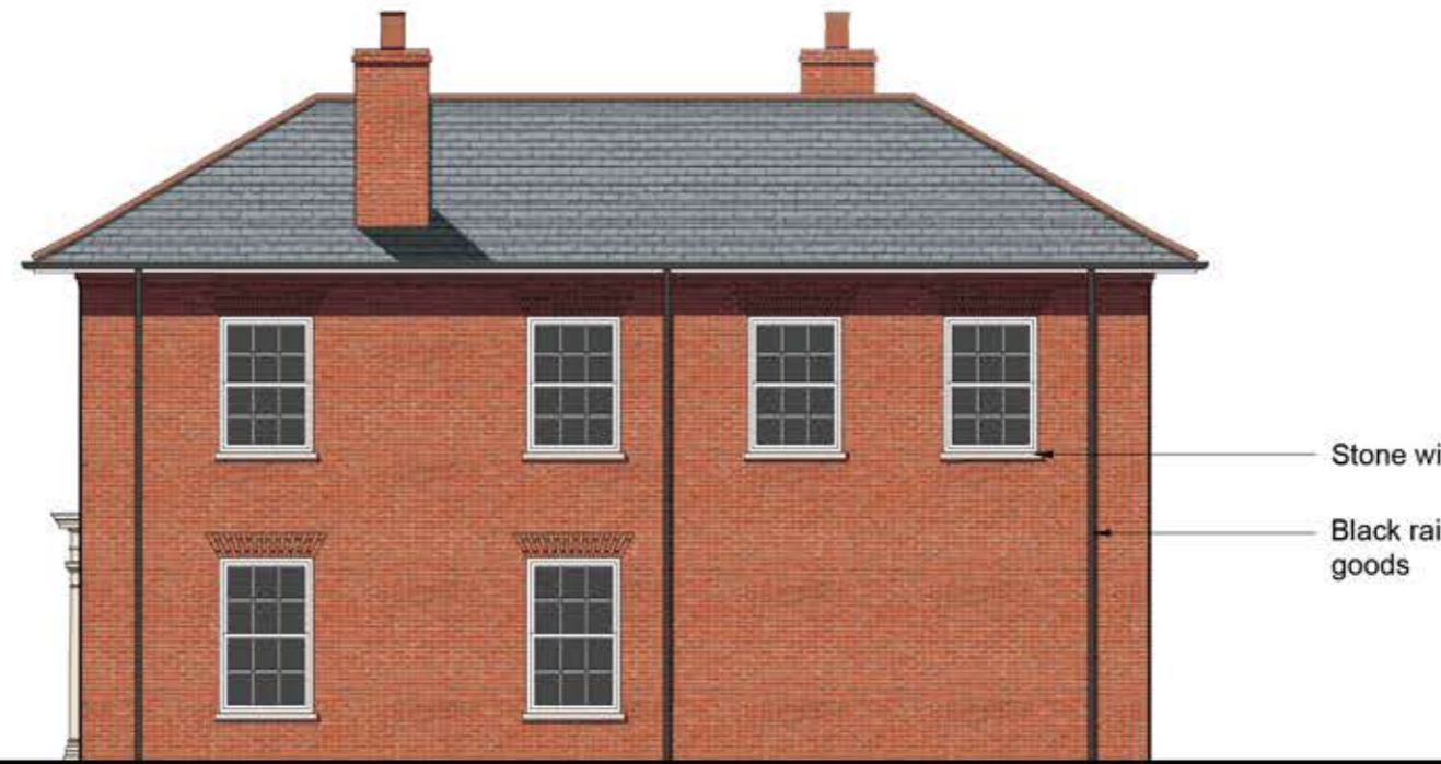
SIDE ELEVATION - East