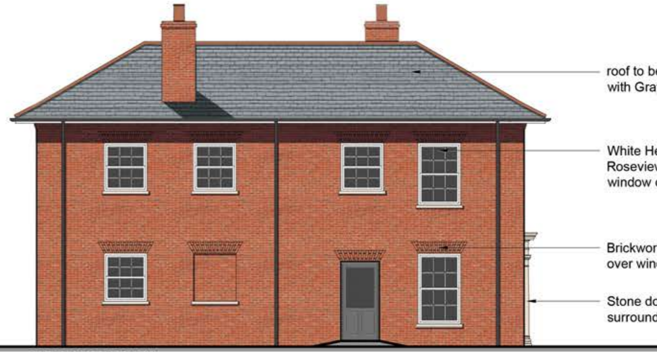
SIDE ELEVATION - West