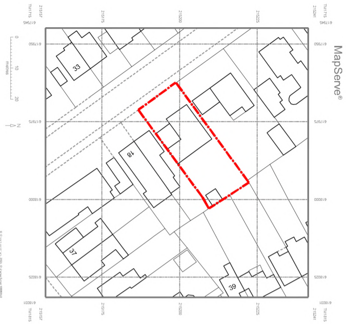
Proposed Block Plan 1:1250