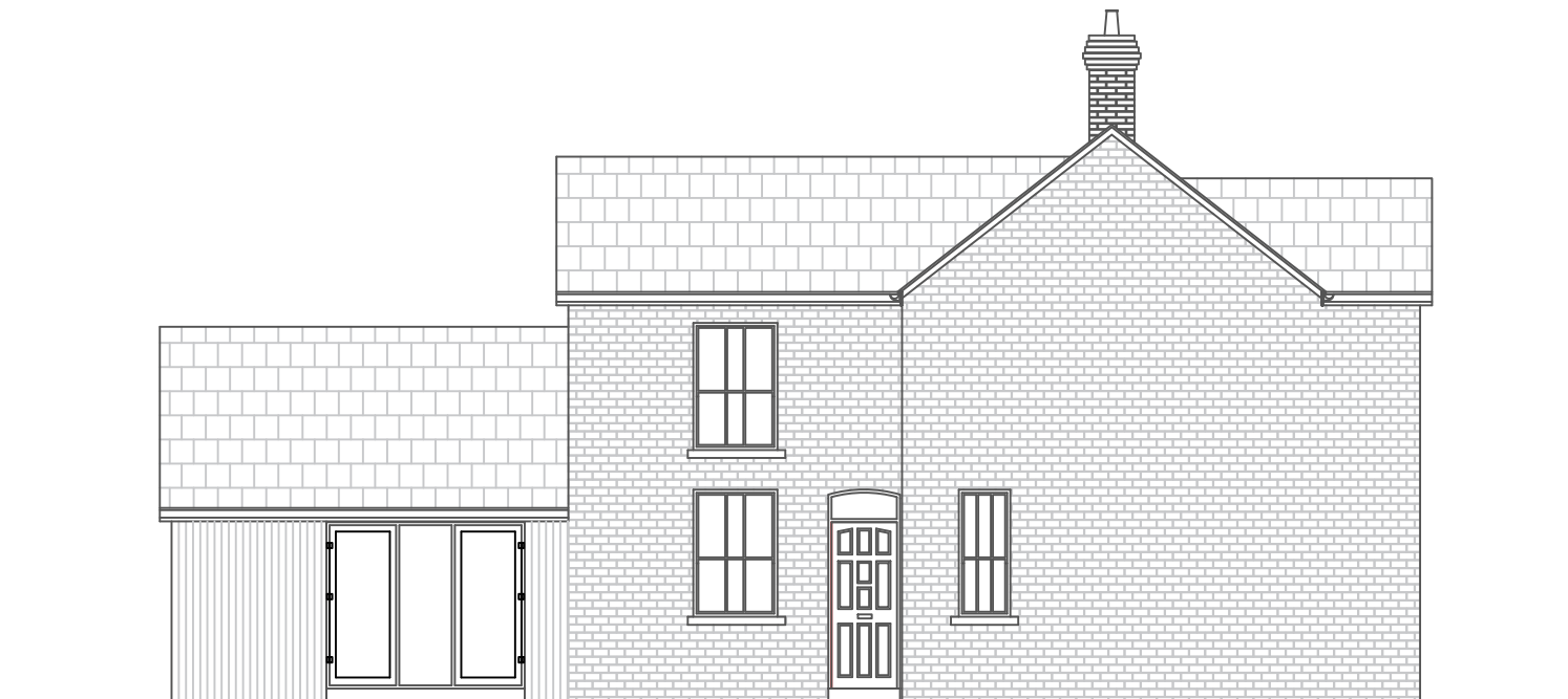
Side (North) Elevation