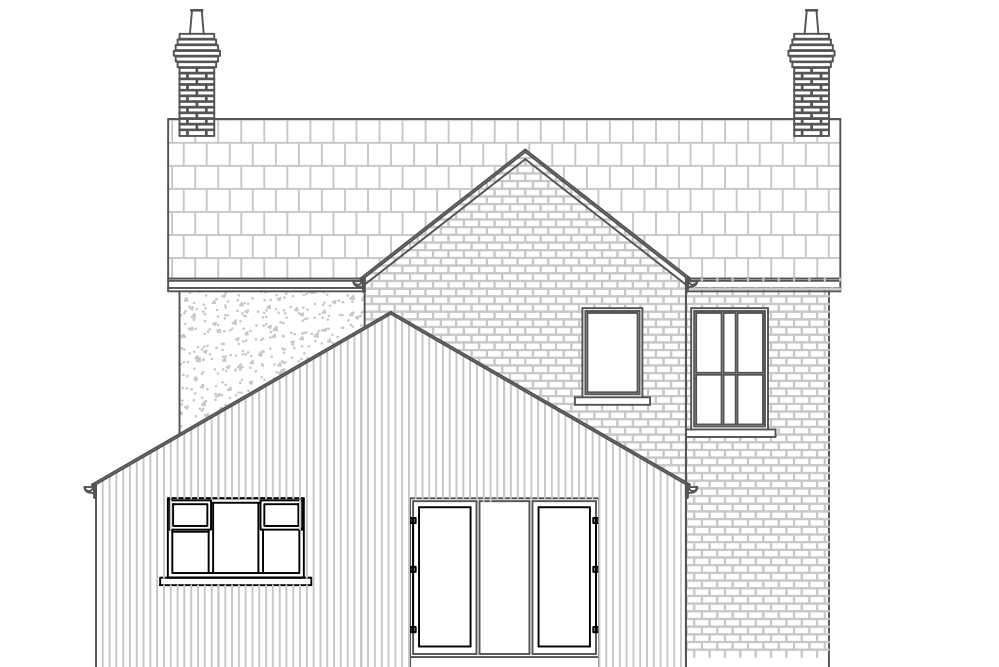
Rear (East) Elevation