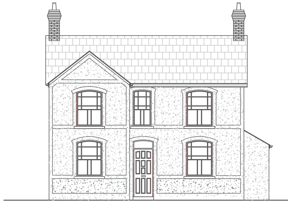
Front (West) Elevation