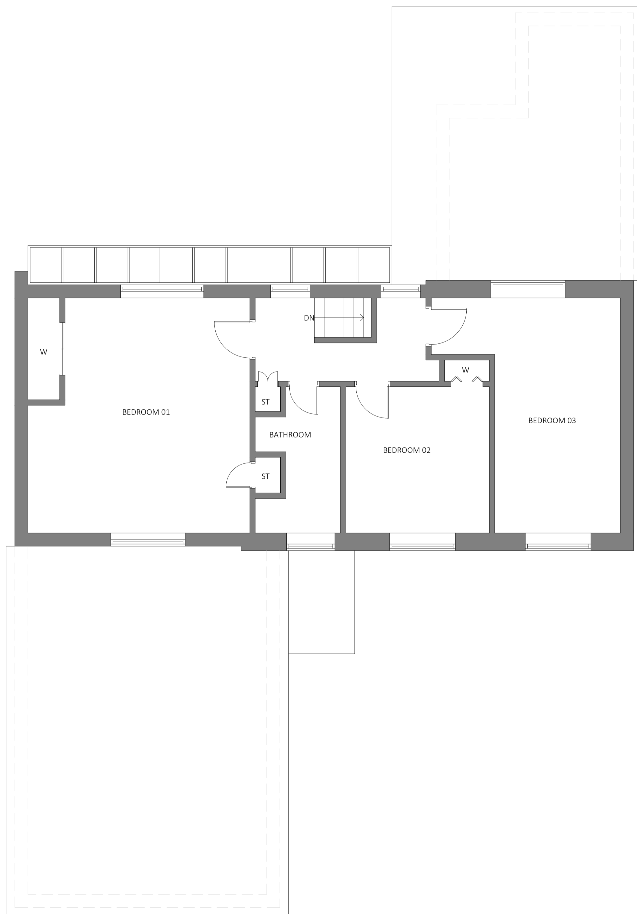
EXISTING FIRST FLOOR PLAN 1:50