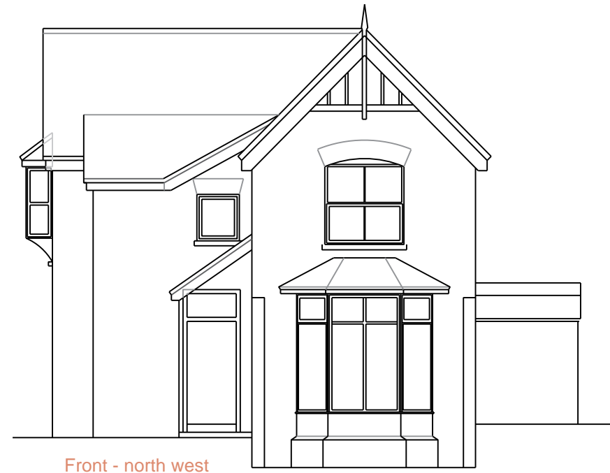
Front - north west