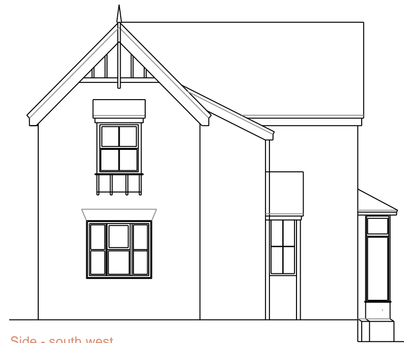
Side - south west