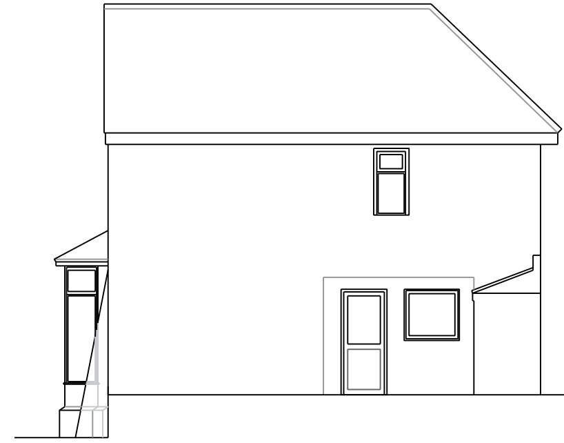
Side - south west