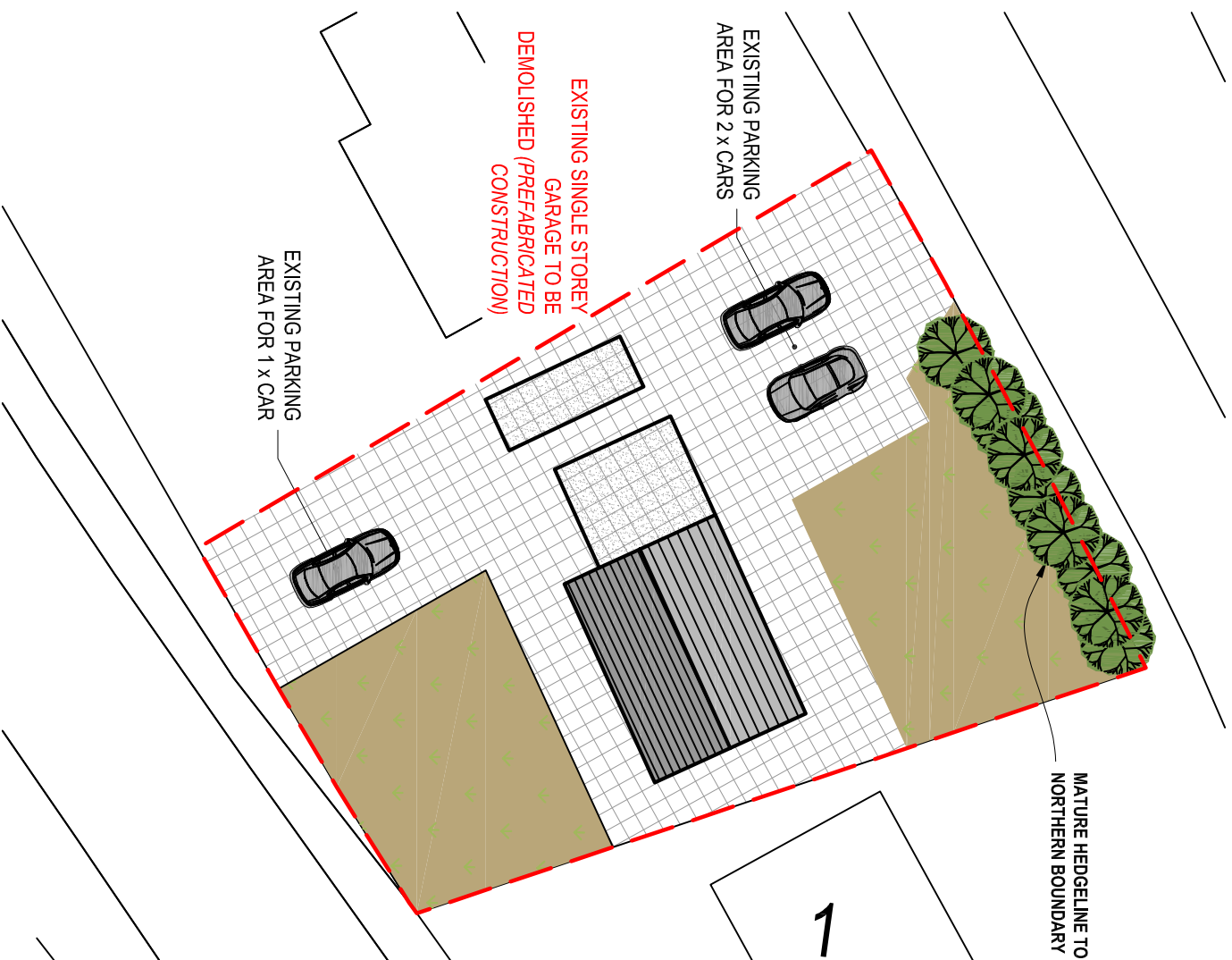
EXISTING SITE PLAN Scale 1:250

Reproduced from an Ordnance Survey map with the permission of the Controller of Her Majesty's Stationary Office. ©Crown Copyright. All rights reserved.