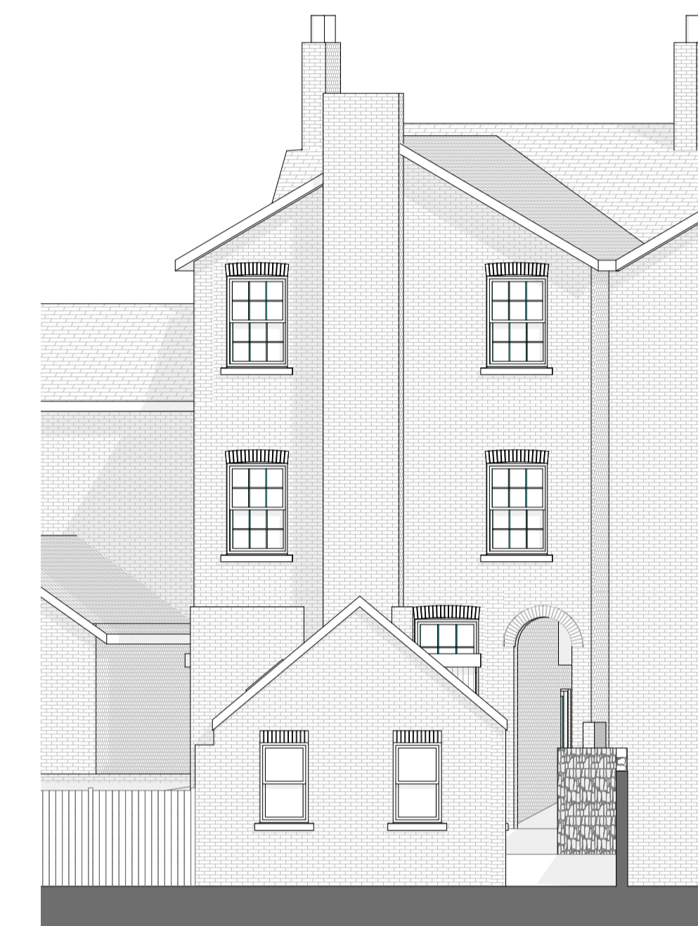
1:100 E4 Rear Elevation