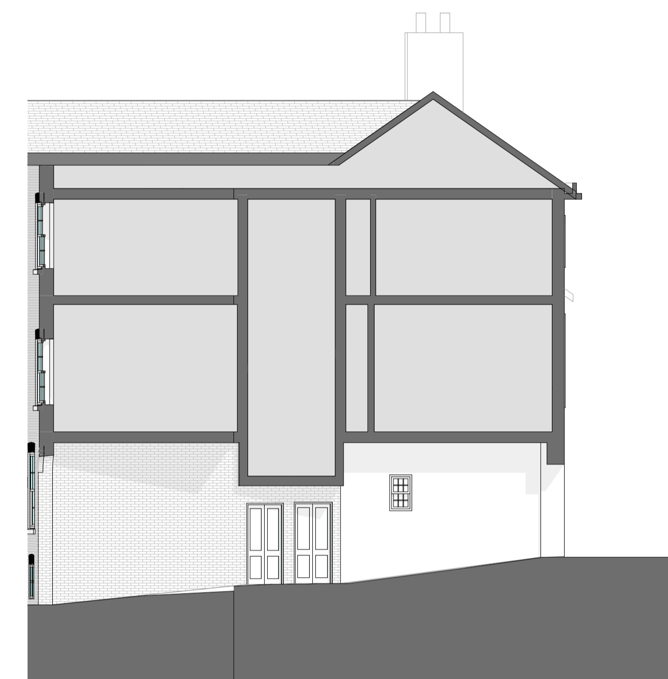
1:100 E2 Side Elevation