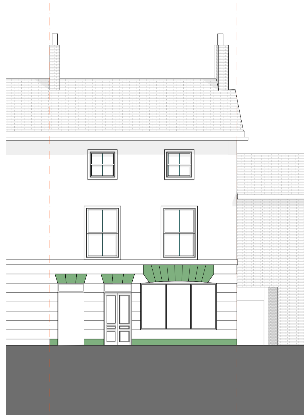
1:100 E1 Front Elevation