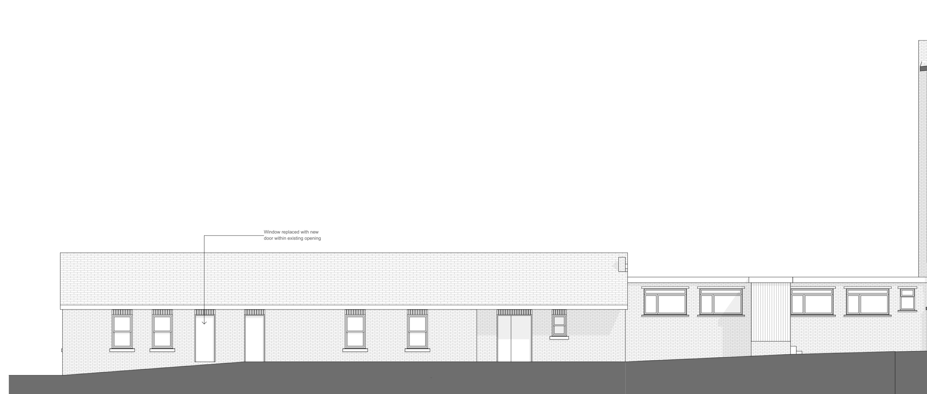
1:100 E3 Side Elevation