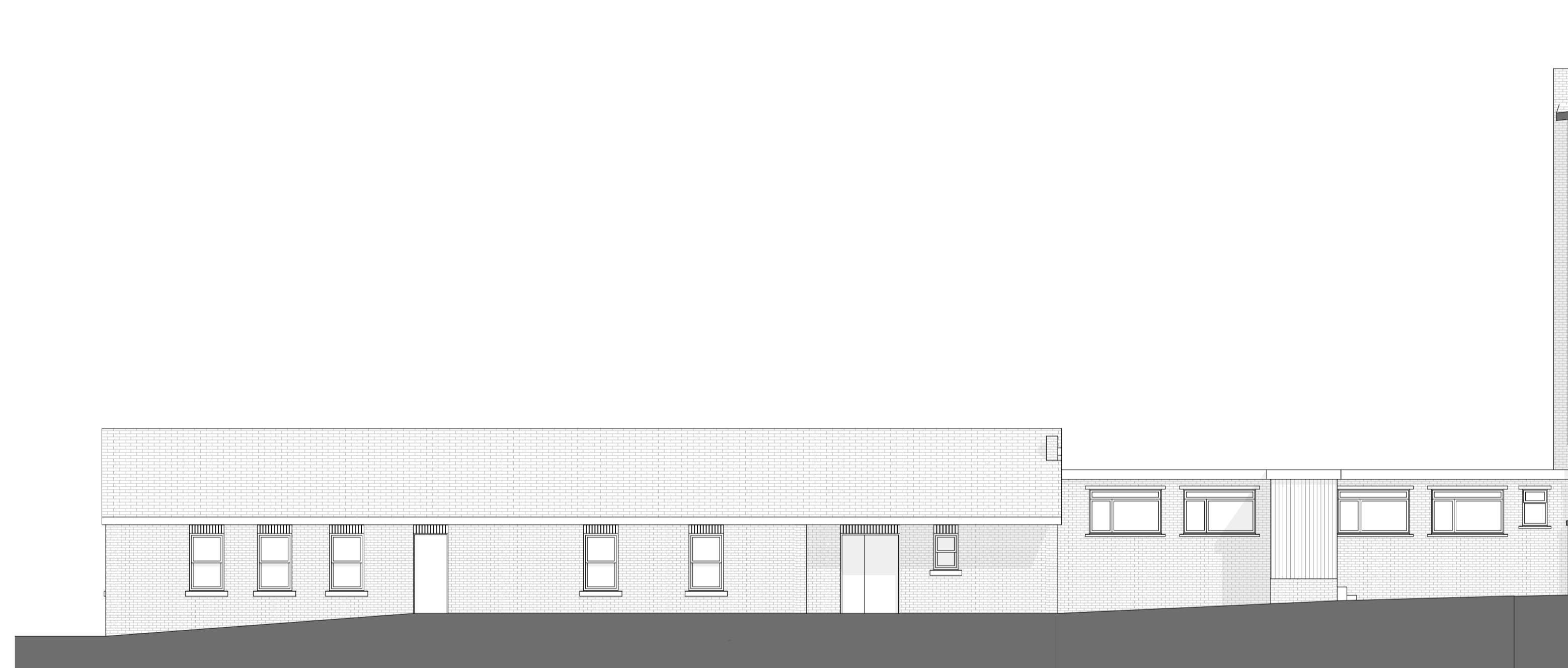
1:100 E3 Side Elevation