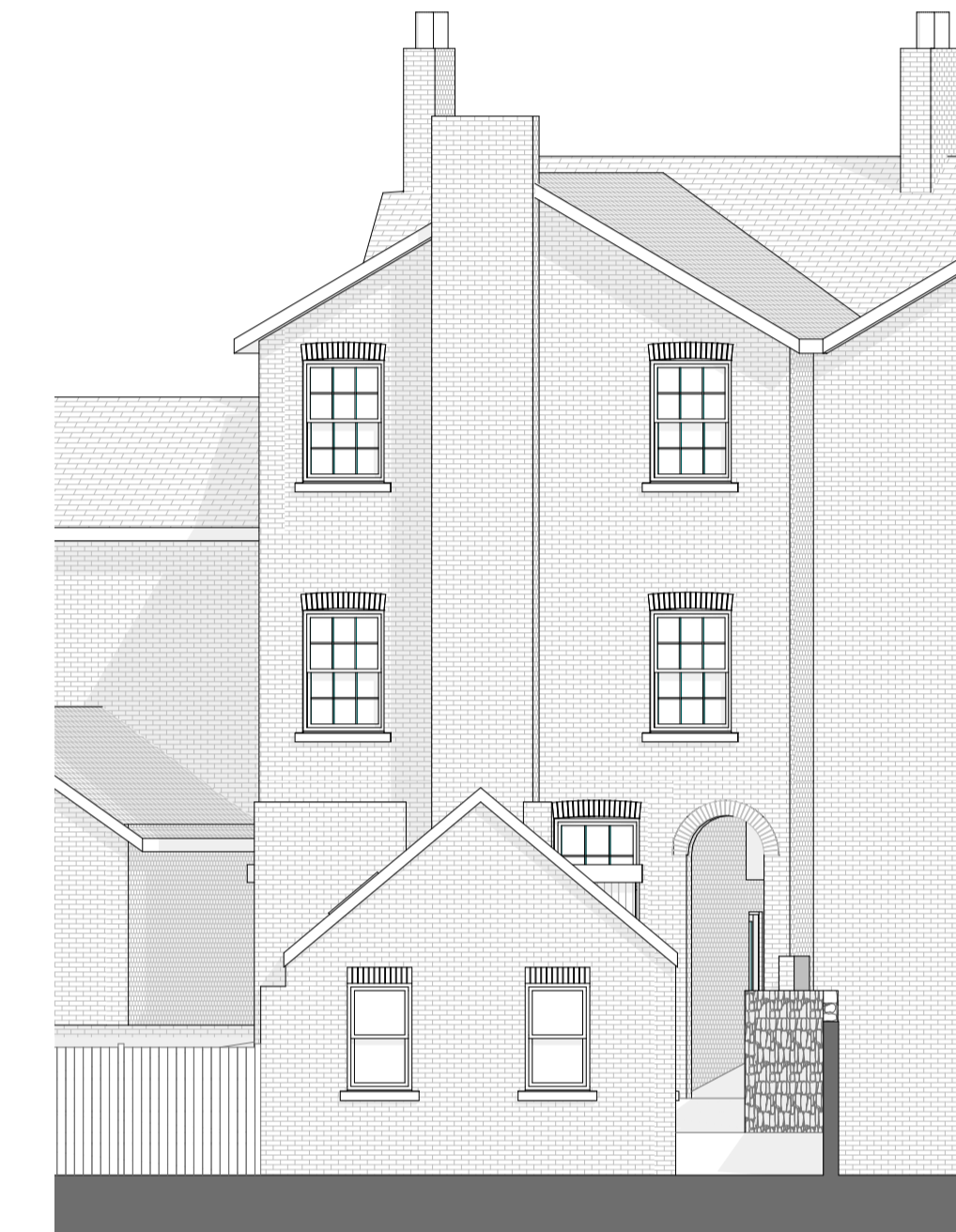
1:100 E4 Rear Elevation