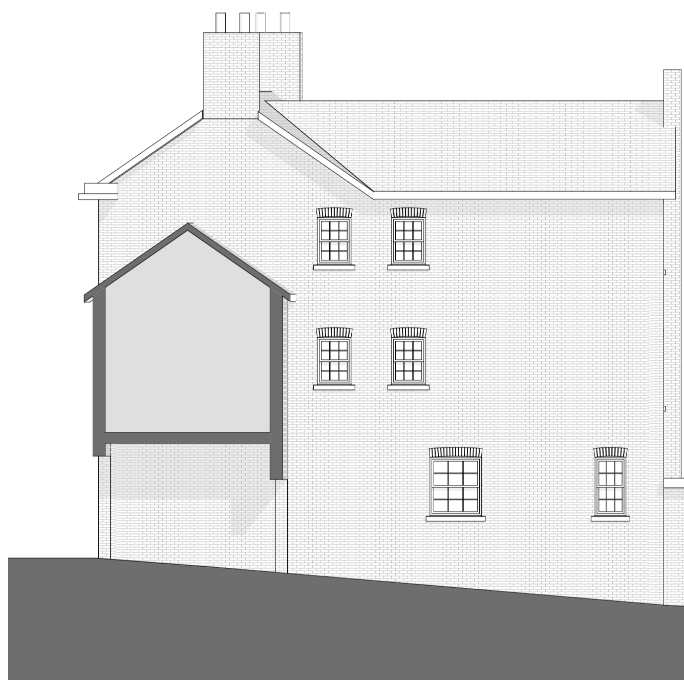
1:100 E6 Side Elevation