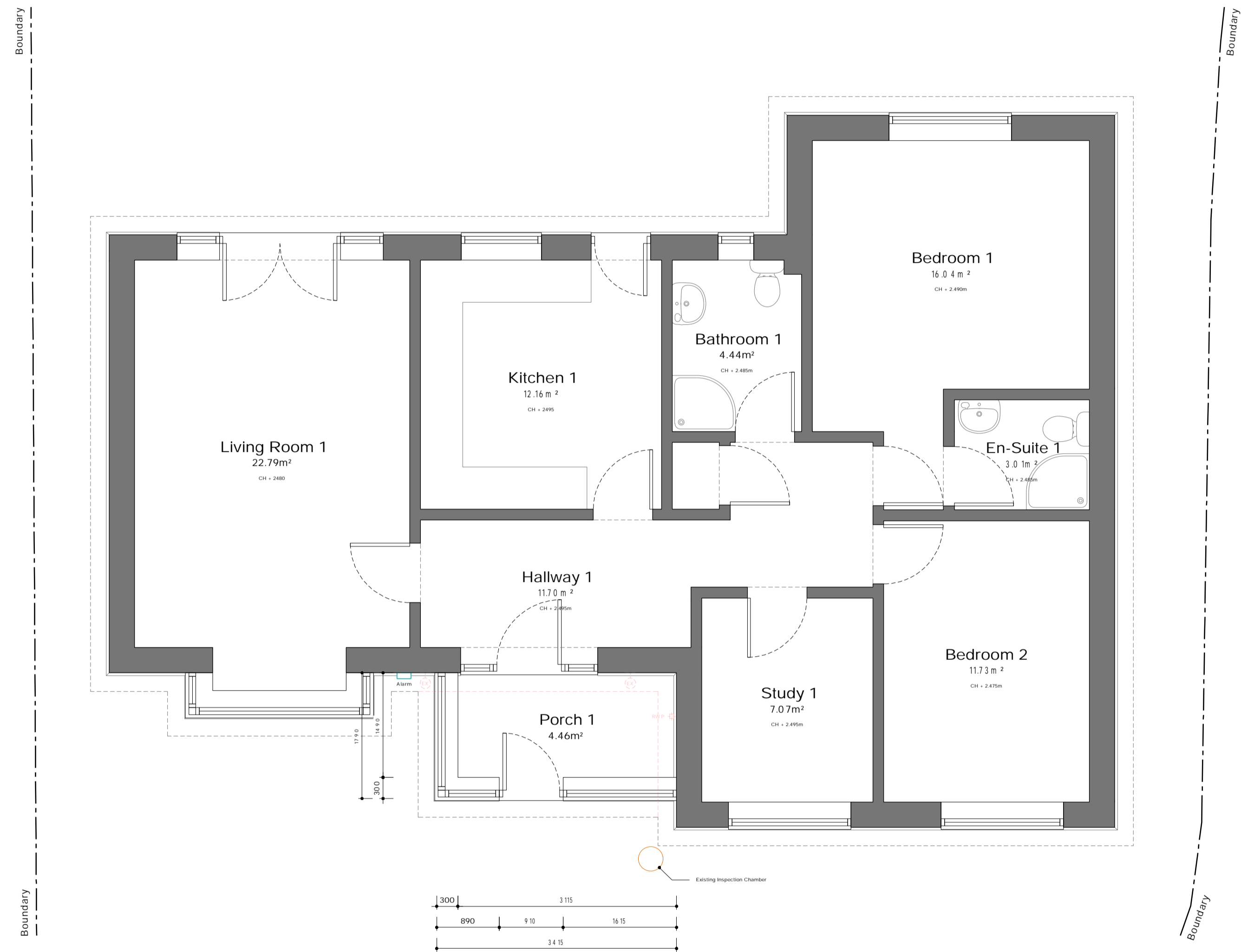
5.1 Proposed Ground Floor Plan Scale 1:50

General Notes Furniture Layout is Diagrammatic only Dimensions are in millimetres unless otherwise stated, and are to block or studwork floors.