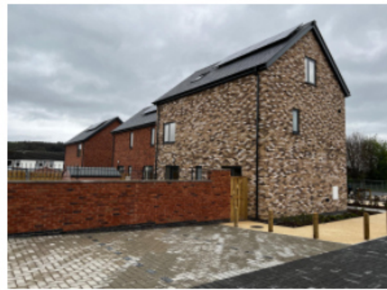
Precedent image 1