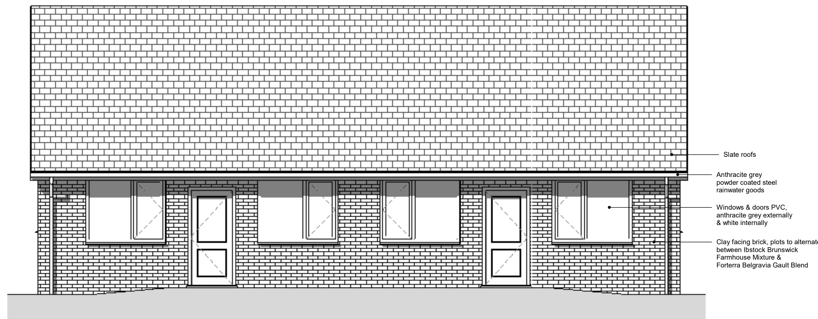
2 Rear Elevation as Proposed 1 : 50