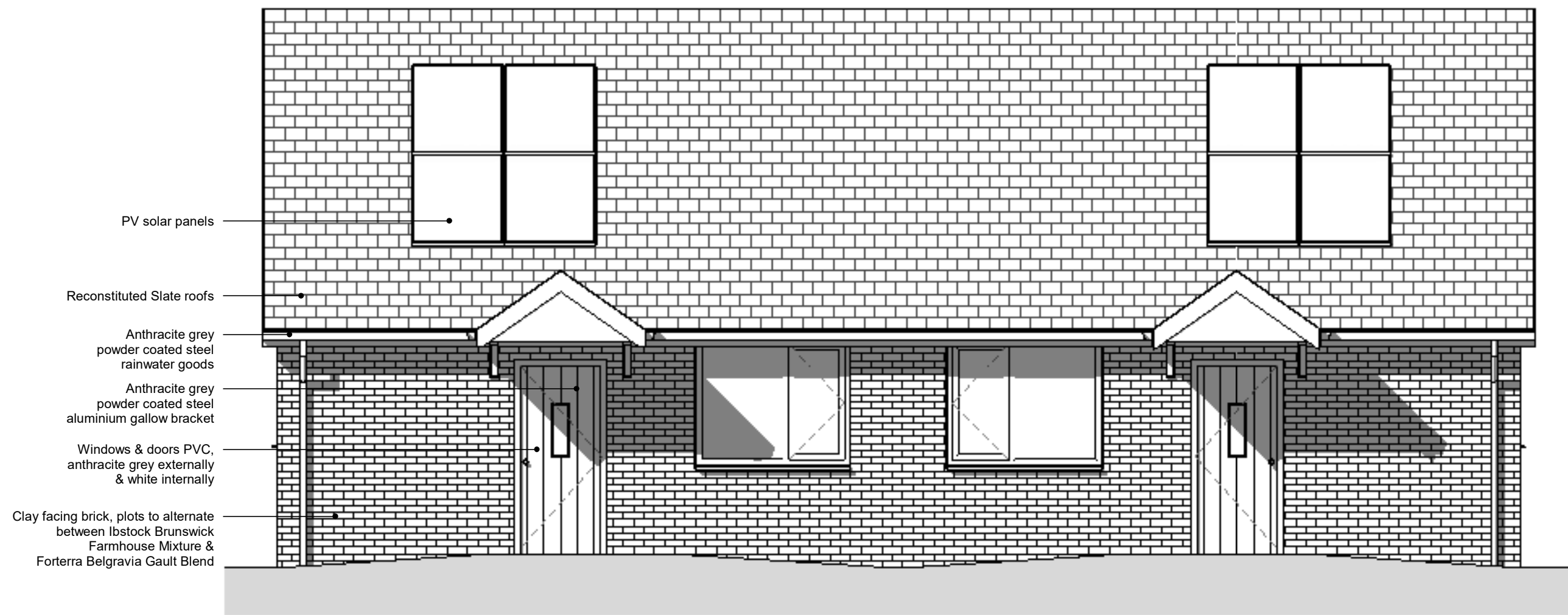
1 Front Elevation as Proposed 1 : 50