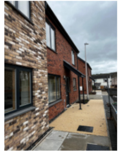
Precedent image 2